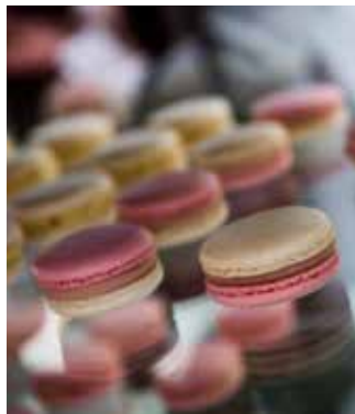
Images: Macarons by Al Strong at Elephant Yard, Farrer's Tea & Coffee Merchants, Lunch in Kendal's Yards

Castle Dairy restaurant and art gallery is set in a magical medieval building and run by Kendal College