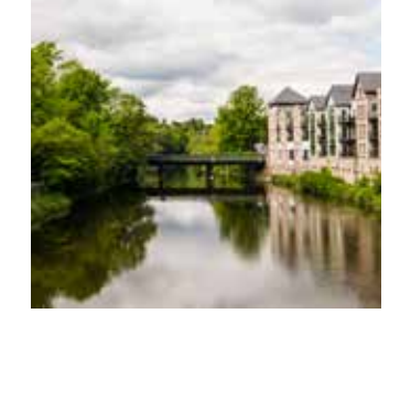
Images: Left: Branthwaite Brow, New Shambles. Right: Cross Lane Projects, Kendal Town Hall, Abbot Hall Art Gallery