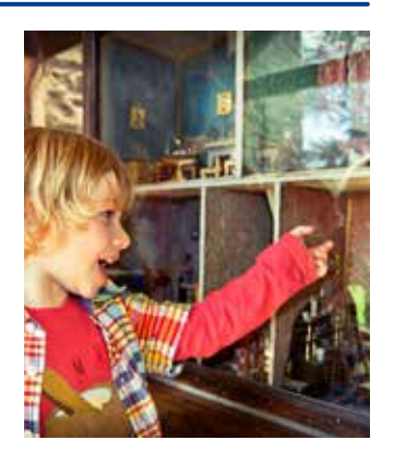
Museum of Lakeland Life and Industry Kirkland, LA9 5AL

Step back in time to see how the people of Cumbria lived, played and worked.